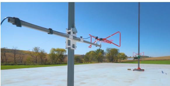
Figure 3. This CISPR antenna test was performed at our outdoor OATS on its CALTS-compliant ground plane.

As further testament to our expertise, standards bodies look to us for guidance during development of specifications. For instance, ANSI working groups have used our site during standards development. In addition, the COE team is on standards boards for ANSI and SAE.